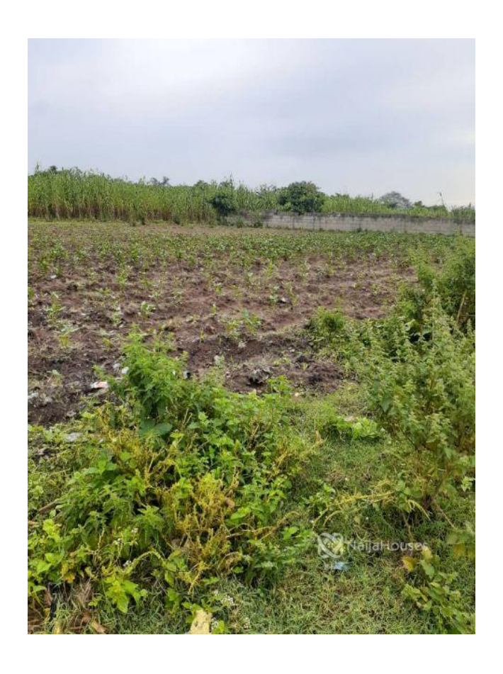
Kuchiyako Bamishi, Abuja, Abuja FCT NGN 3,500,000.00