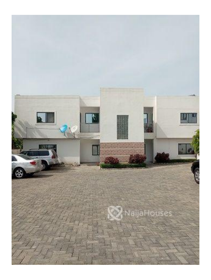
Asokoro, Abuja, Abuja FCT NGN 600,000,000.00