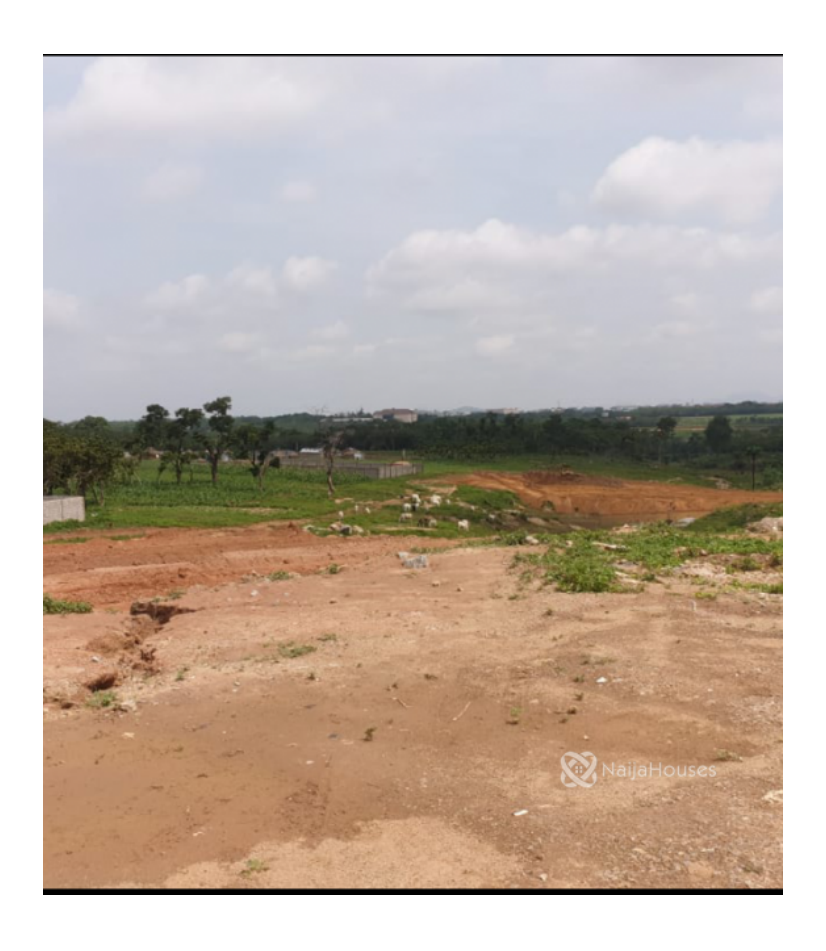
Bedind VIO Office, Katampe, Abuja, Abuja FCT NGN 75,000,000.00