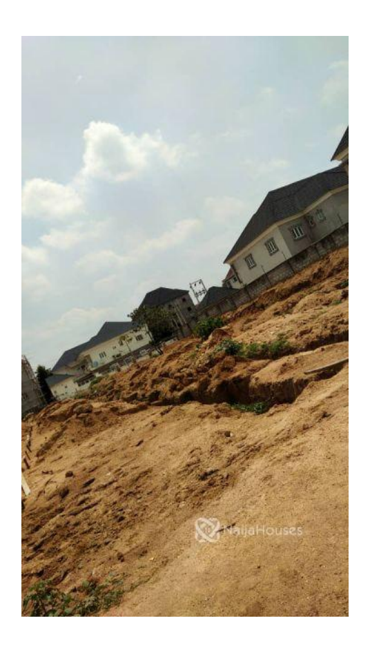
Cadastrial Zone, Jahi, Abuja, Abuja FCT NGN 70,000,000.00