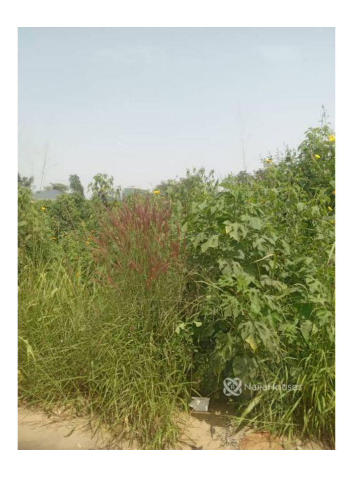
central area, Abuja, Abuja FCT NGN 1,500,000,000.00