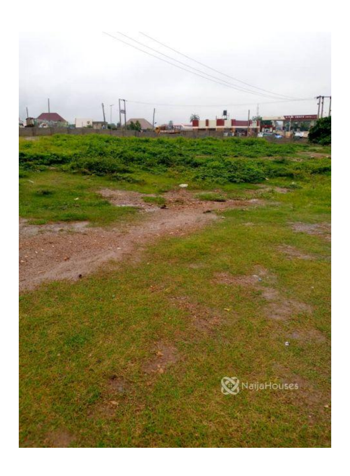
dei-dei/zuba express way, Abuja, Abuja FCT NGN 165,000,000.00