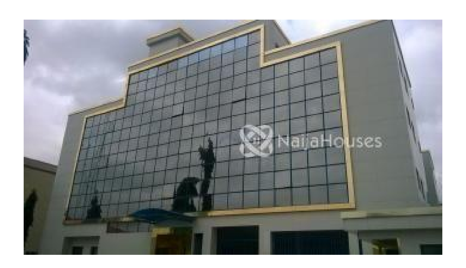
garki, #4000, Garki, Abuja, Abuja FCT NGN 40,000.00

Tobi Mustapha 8 itedo village, bamidele crescent, Lekki, Lekki, Lagos Nigeria