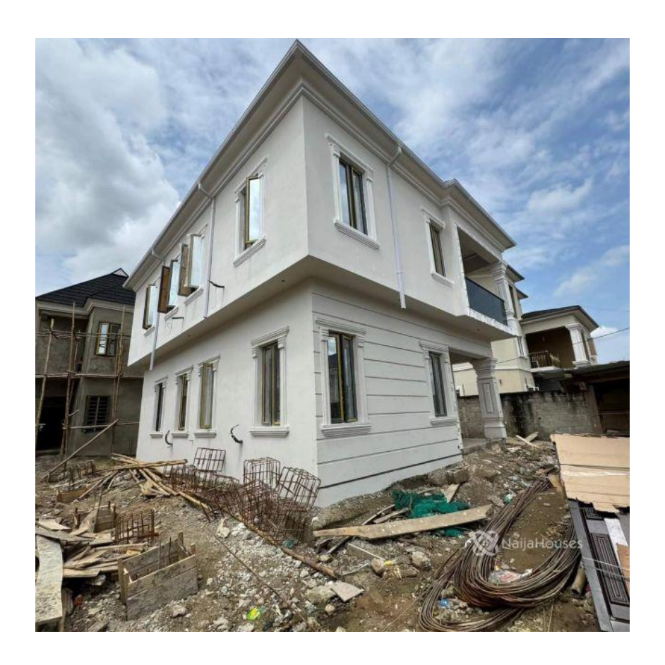
Gbagada, Lagos , Shomolu, Lagos NGN 200,000,000.00

Elvis Ighavongbe 41a Shittu Animashaun Street, Gbagada Phase 2 GRA , Shomolu Central, Lagos, Lagos Nigeria