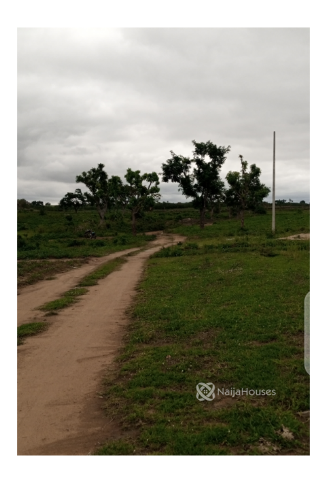
Gwagwalada, Abuja, Abuja FCT NGN 180,000,000.00