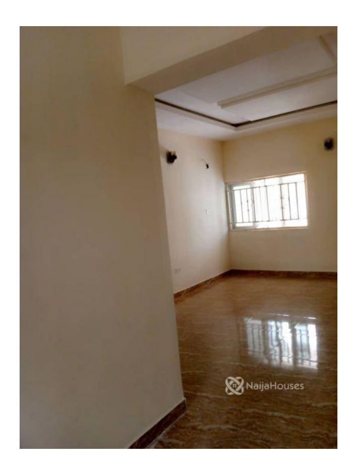
Jahi, Abuja, Abuja FCT NGN 3,000,000.00