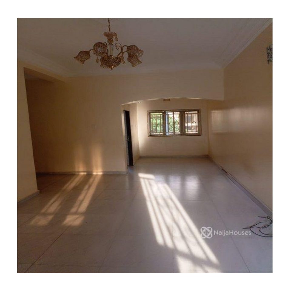
Jahi district, Abuja, Abuja FCT NGN 5,000,000.00