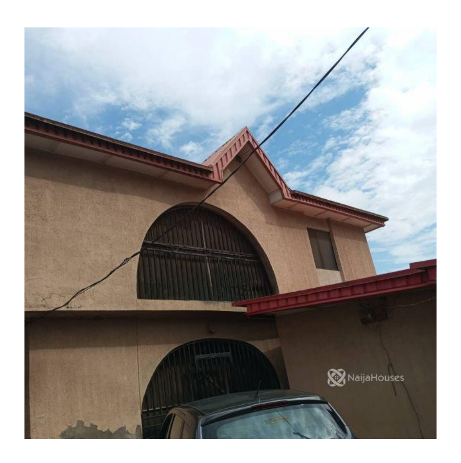
Jibowu street off agbe road abule egba, Abule Egba, Lagos NGN 60,000,000.00

Temitope Oke Omole Phase 1, Lagos Nigeria