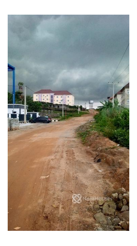
Katampe, Abuja, Abuja FCT NGN 90,000,000.00