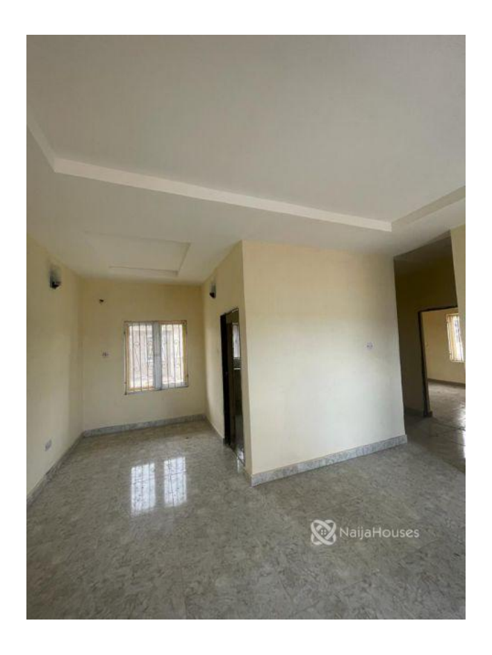
Kuje, Abuja, Abuja FCT NGN 12,000,000.00