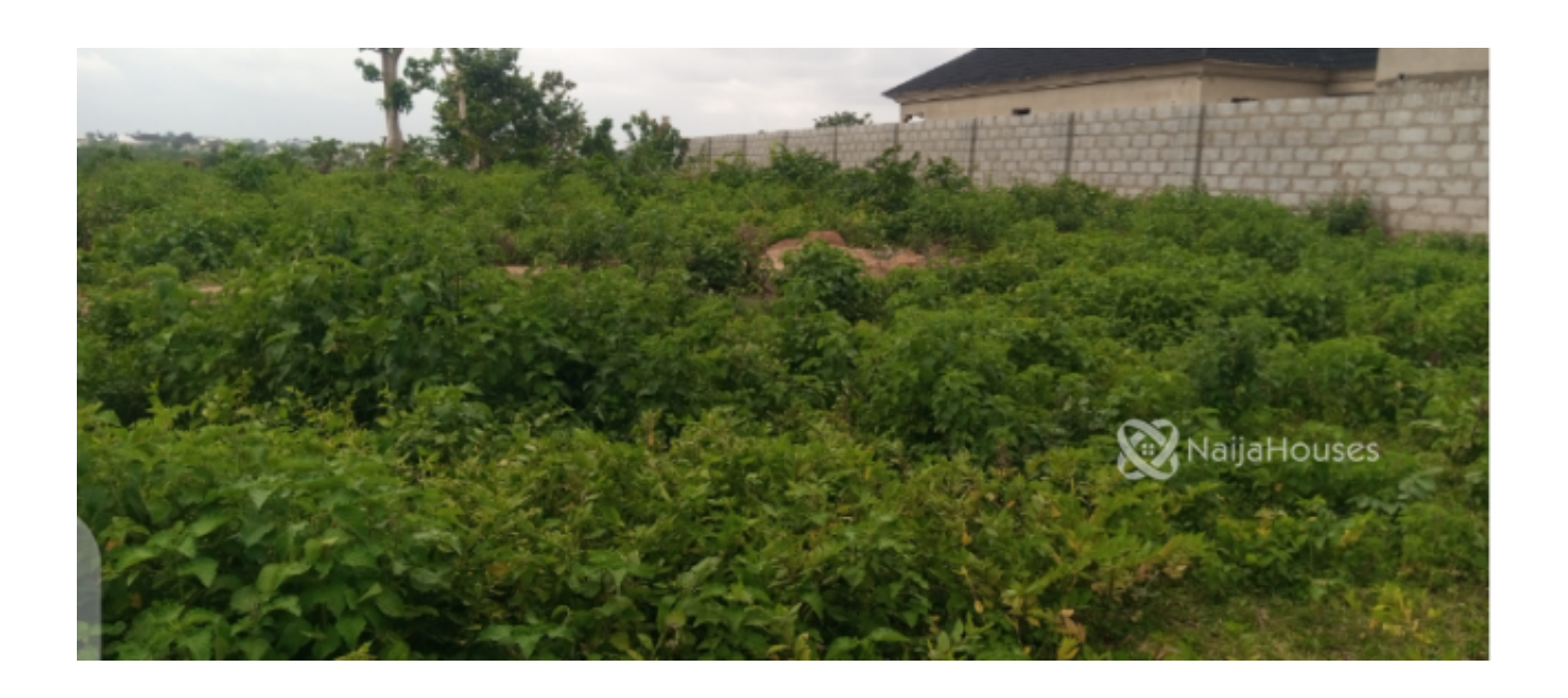
Kuje, Abuja, Abuja FCT NGN 10,000,000.00