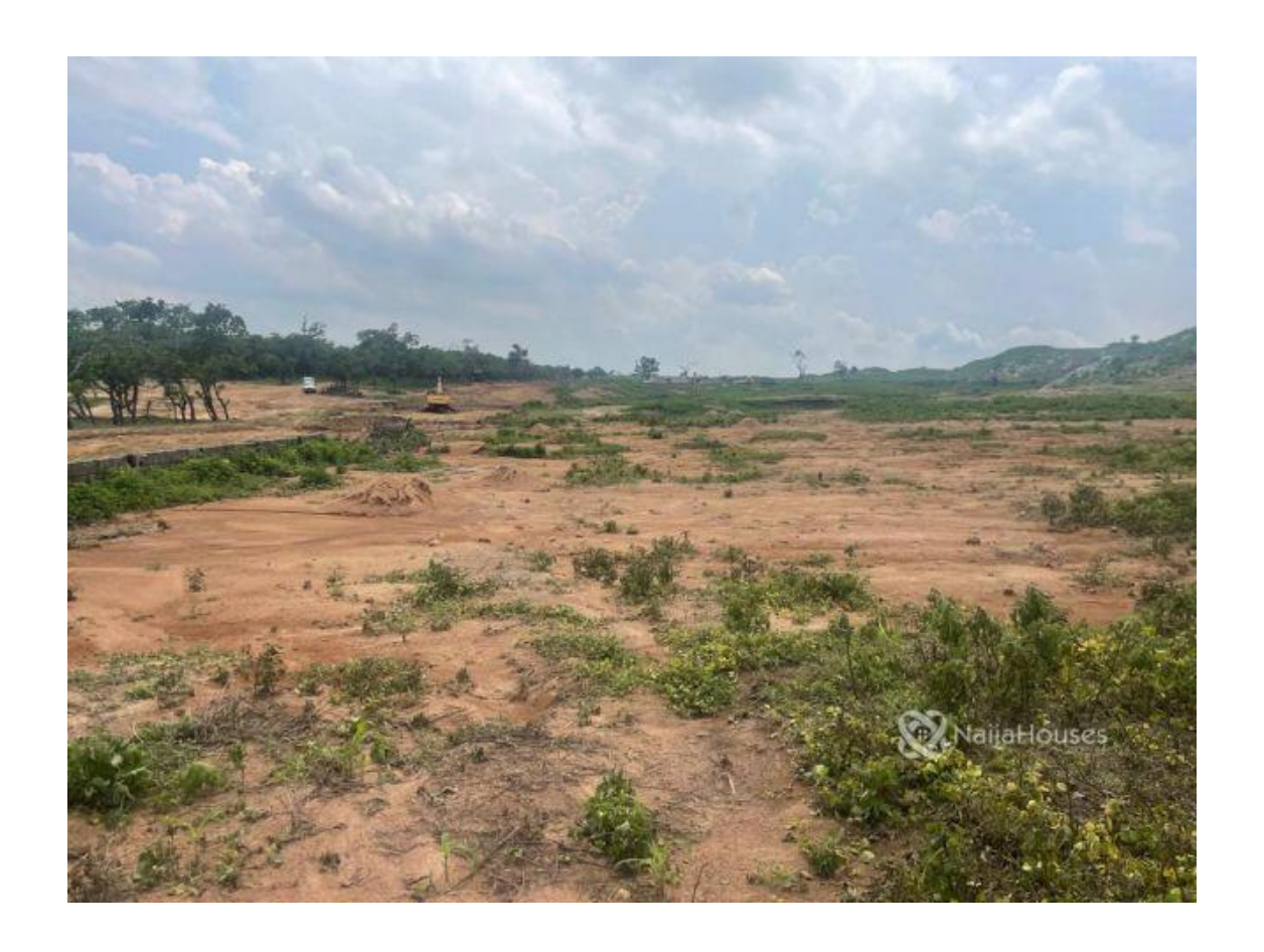
kwali, Abuja, Abuja FCT NGN 7,000,000,000.00