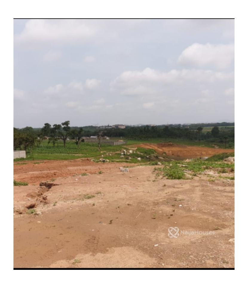
Kyami District, Abuja, Abuja FCT NGN 400,000,000.00