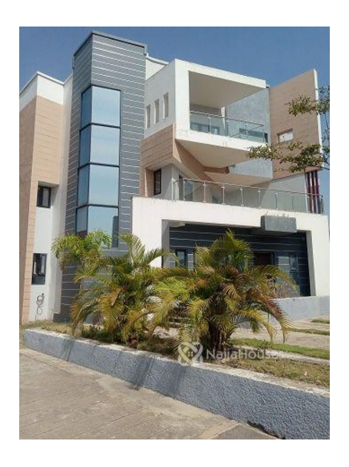
Mbora, Abuja, Abuja FCT NGN 190,000,000.00