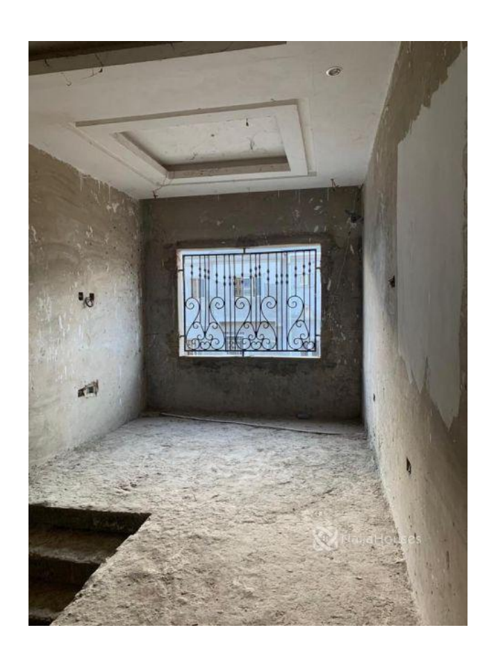
Phase 4 New Karmo, Abuja, Abuja FCT NGN 48,000,000.00