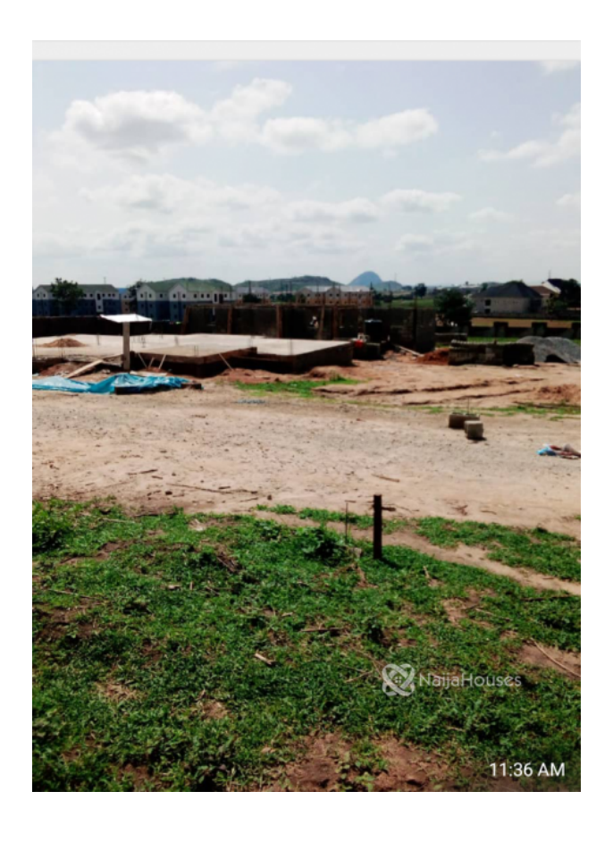
Pyakasa, Lugbe, Abuja, Abuja FCT NGN 5,000,000.00